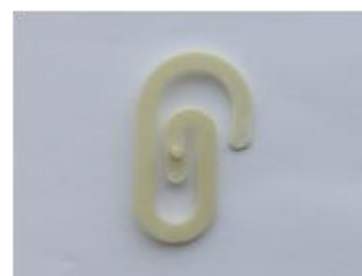
Dow Corning 31-441 Additive 2wt%